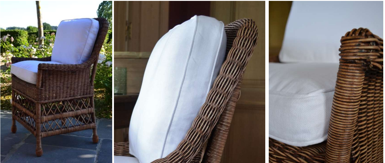
CUSHIONS SHOWN IN MADISON FABRIC COLOUR 12021

Back & seat cushion set – minimum order of 4 sets - fabric (1.65 m per set) not included : Please contact us for current pricing